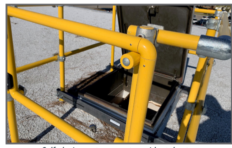
Self-closing gate prevents accidental entry.

The DynaRound Hatch Guard mounts directly to the roof hatch with a compression fit design. No drilling necessary means rooftop water integrity is not compromised. Multiple sizes are available to fit almost any hatch. Yellow or gray FRP posts and guardrails with galvanized fittings and self closing gate ensure a long service life.