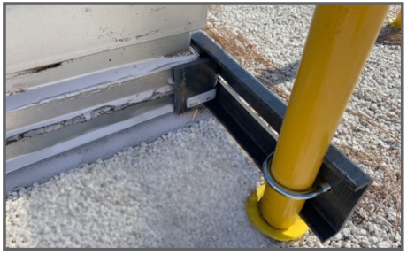
Width adjustable to allow for hatch size variations.