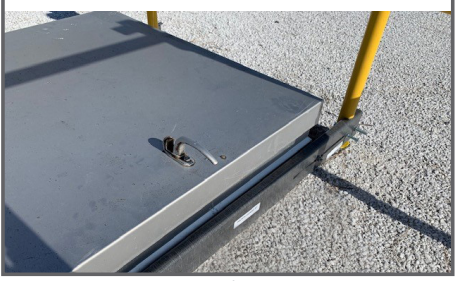
Unique compression fit design. No drilling!