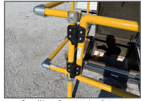
Rugged hinges allow gate tension adjustment.